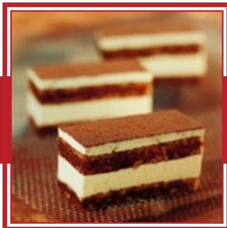
TIRAMISU GLASS CUP