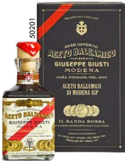
Banda Rossa: Aged in barrels that date back to the 1700's.