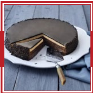
CHOCOLATE TEMPTATION CAKE