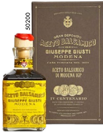
Fourth Centenary: Grapes aged in a series of barrels from the 1800's.