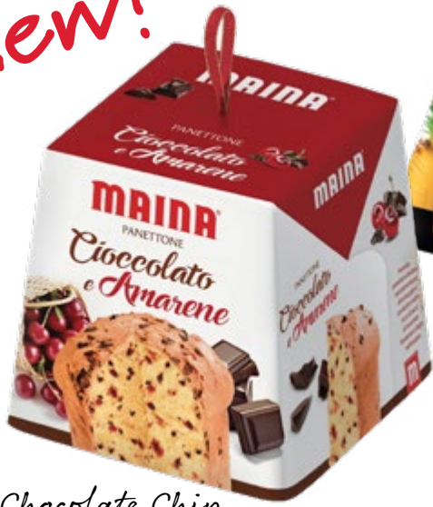
Chocolate Chip w/ Amerene cherries