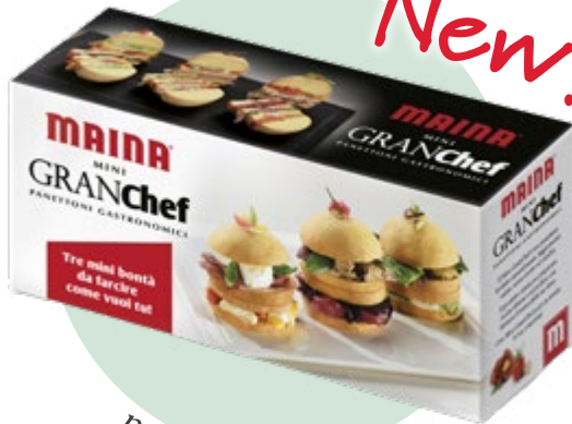
mini gran chef