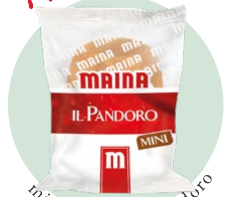
mini flowpack pandoro