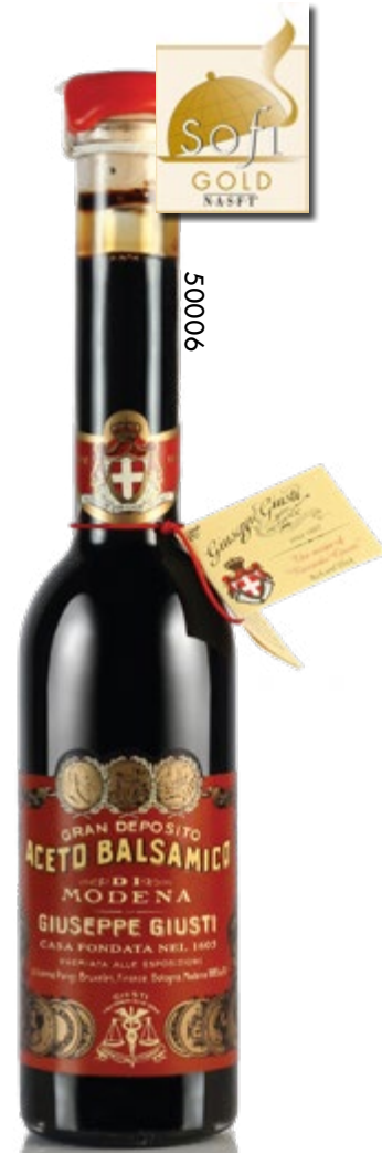
Riccardo: late harvest grapes aged in antique barrels. A dense balsamic with a pleasantly sweet aftertaste.