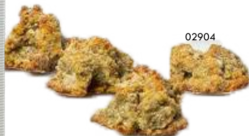
Pistachio & Almond Brutti Buoni