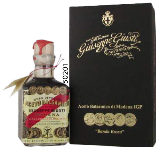
Banda Rossa: Aged in barrels that date back to the 1700's.