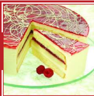
RASPBERRY LIMONCELLO CAKE