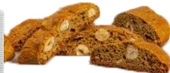
Hazelnut w/ Chestnut Flour Cantucci