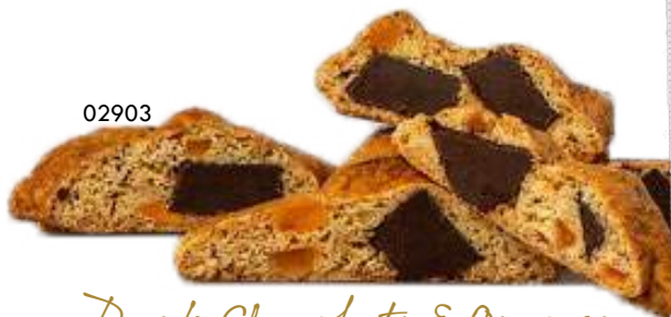
Dark Chocolate & Orange Cantucci