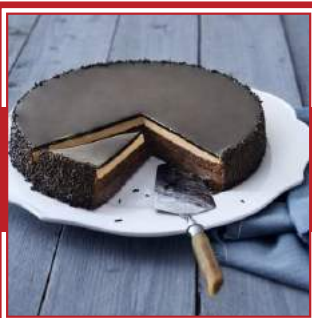
CHOCOLATE TEMPTATION CAKE