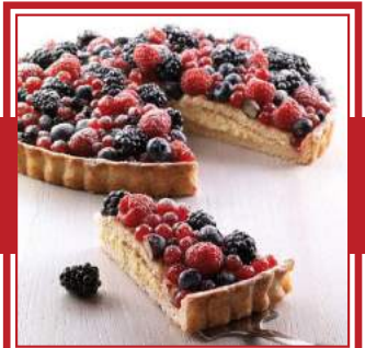
MIXED BERRY TART