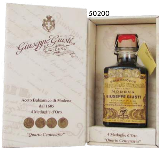
Fourth Centenary: Grapes aged in a series of barrels from the 1800's.