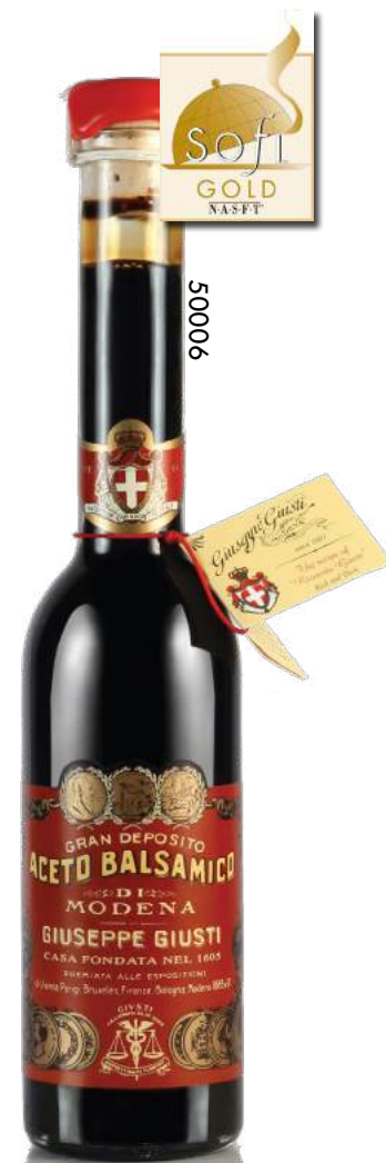
Riccardo: late harvest grapes aged in antique barrels. A dense balsamic with a pleasantly sweet aftertaste.