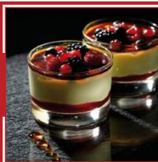
CREME BRULEE W/ MIXED BERRIES