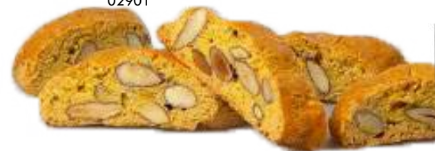
Almond & Pinenut Cantucci