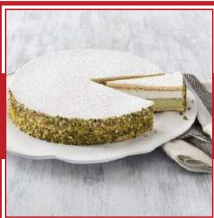
RICOTTA PISTACHIO CAKE