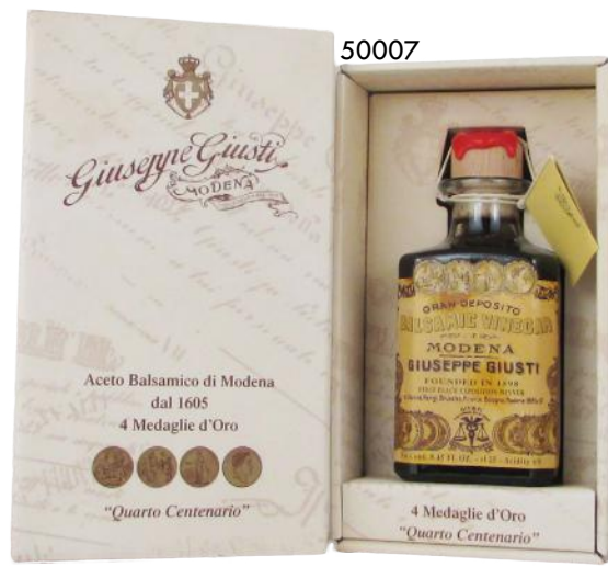
Fourth Centenary: Grapes aged in a series of barrels from the 1800's.