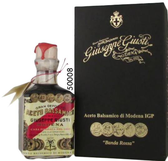
Banda Rossa: Aged in barrels that date back to the 1700's.