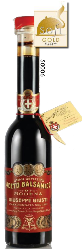
Riccardo: late harvest grapes aged in antique barrels. A dense balsamic with a pleasantly sweet aftertaste.